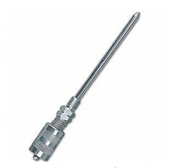
Figure 1: Needle nose grease fitting adapter.