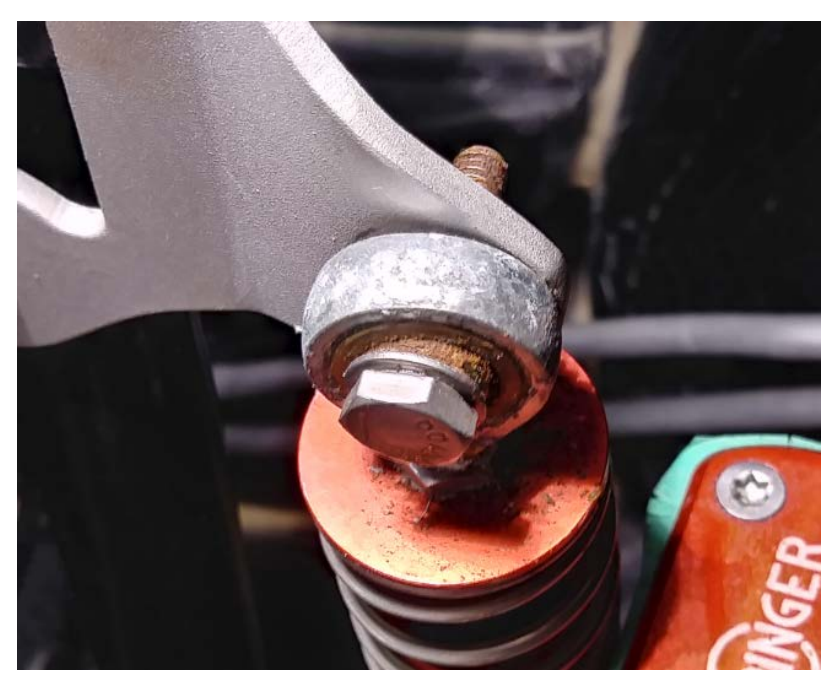
Figure 2: Unacceptable Corrosion on rod end.