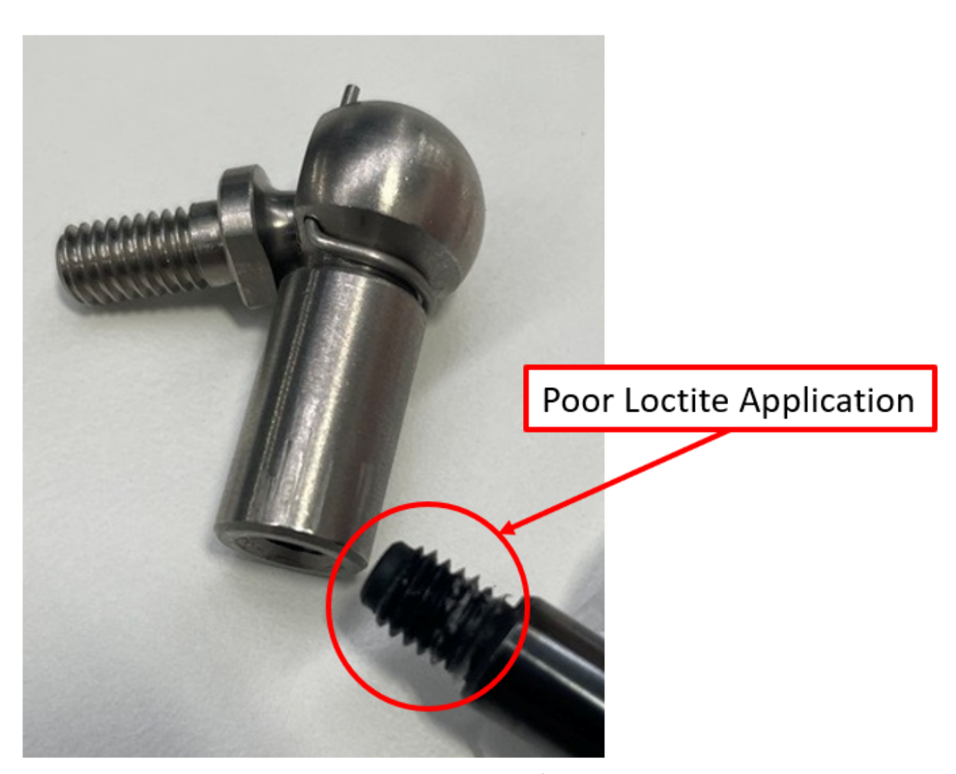
Figure 2 Poor Loctite Application