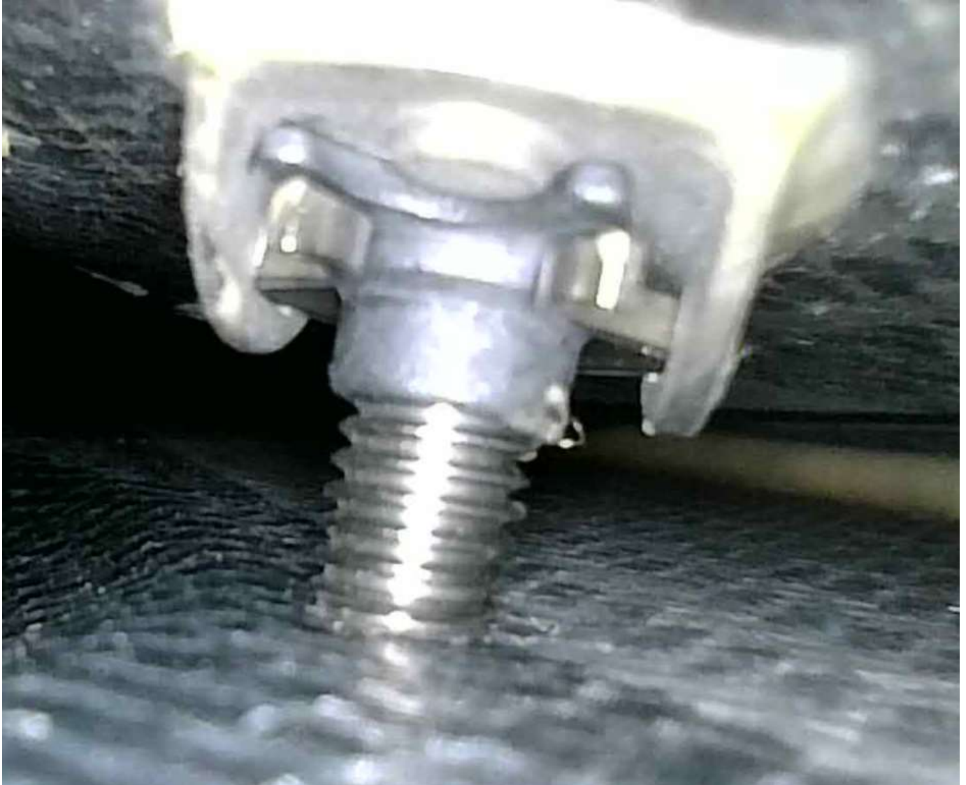
Figure 4 Flap Bracket Bolt Crashing Into Wing Skin

If there is no damage to either the outer or inner wing skins, the inspection is complete, and this safety directive has been satisfied.