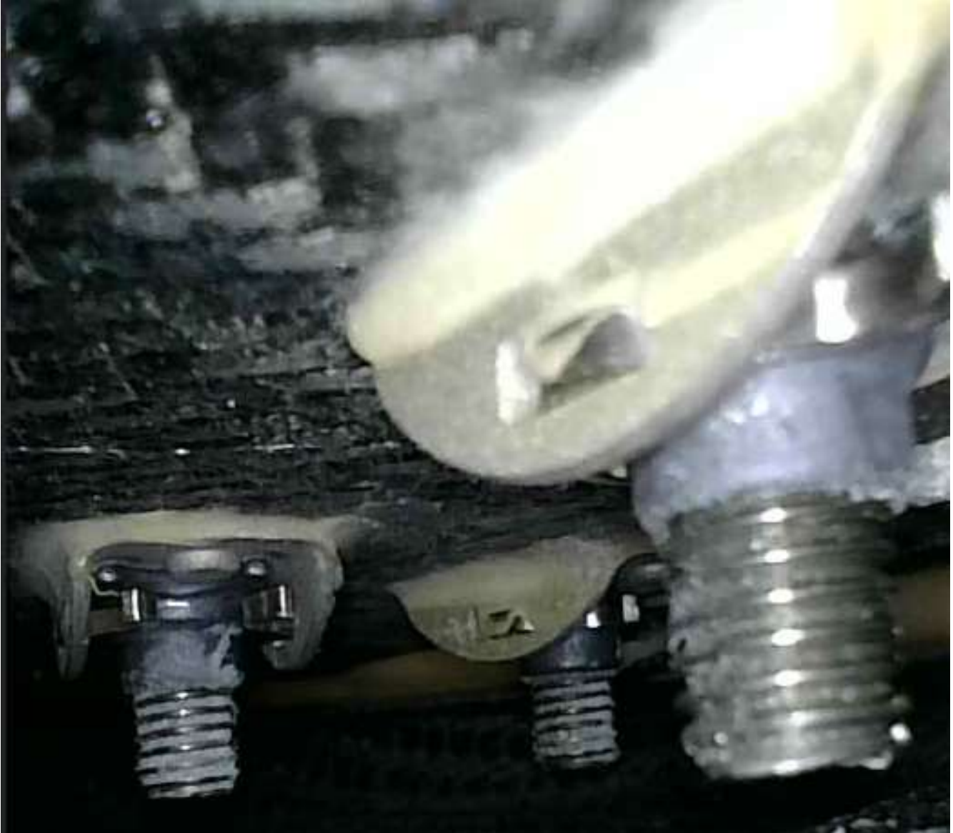
Figure 3 Flap Bracket Bolts