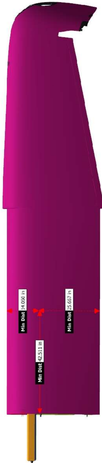
Figure 1 Location of Bulge