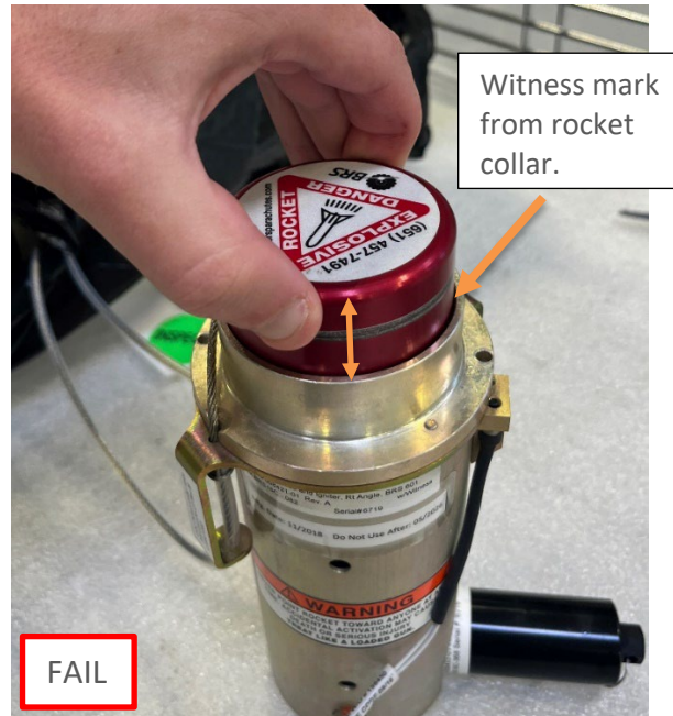
Figure 2: Rocket Motor Lifted from Housing