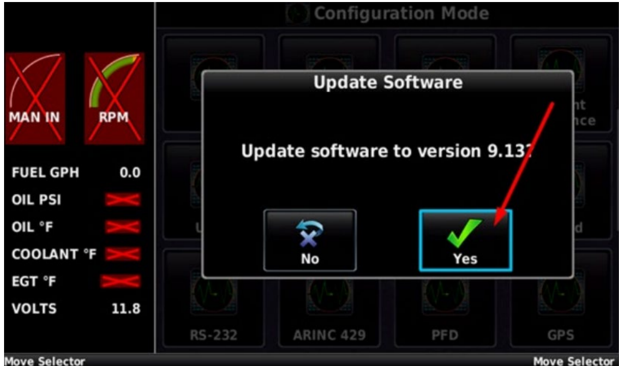
Figure 2. Update Software Screen (version 9.13 shown)

NOTE: Software 9.13 is shown as an example in Figure 2. When downloaded, the latest version will be shown on the update screen on the G3X.