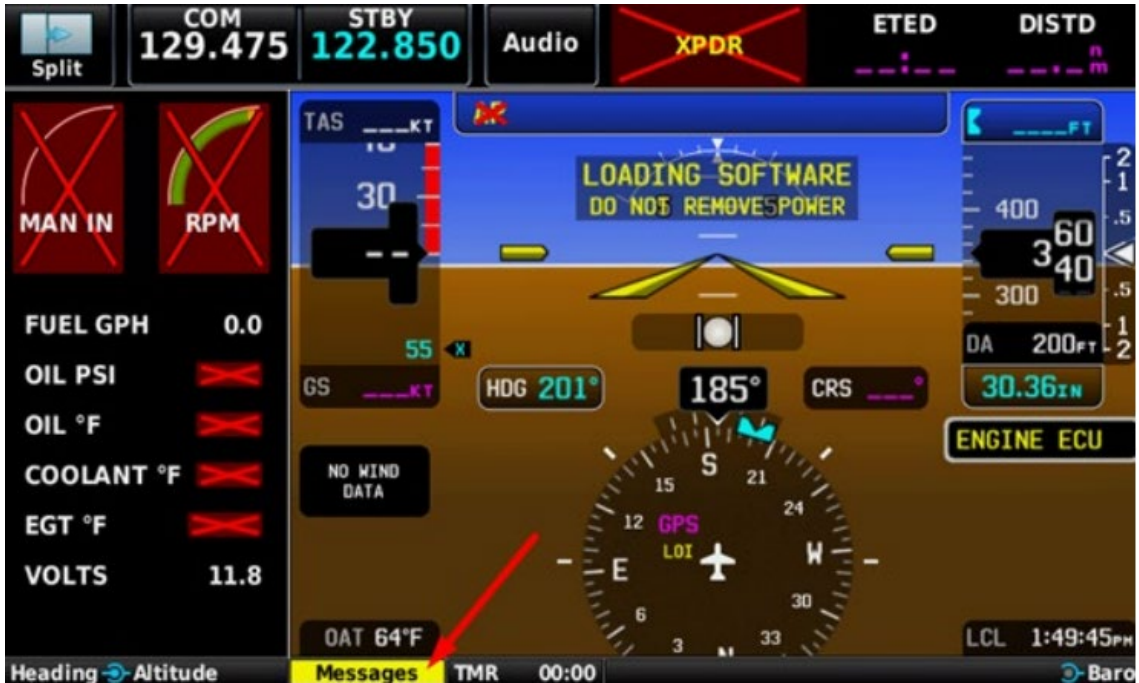
Figure 3. Messages