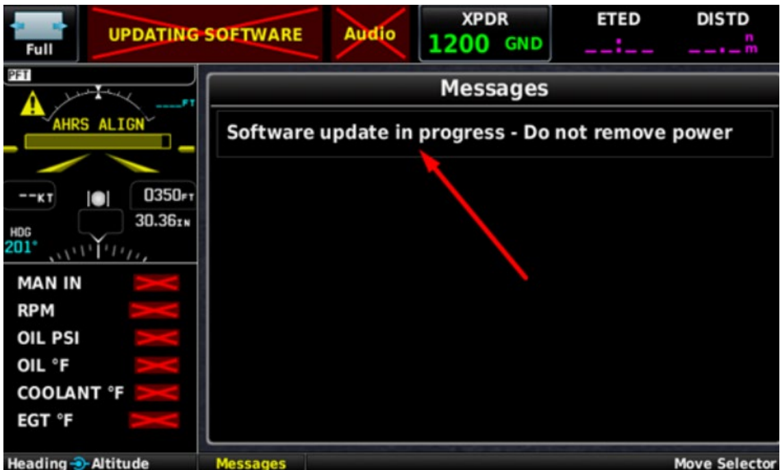
Figure 4. Update Message